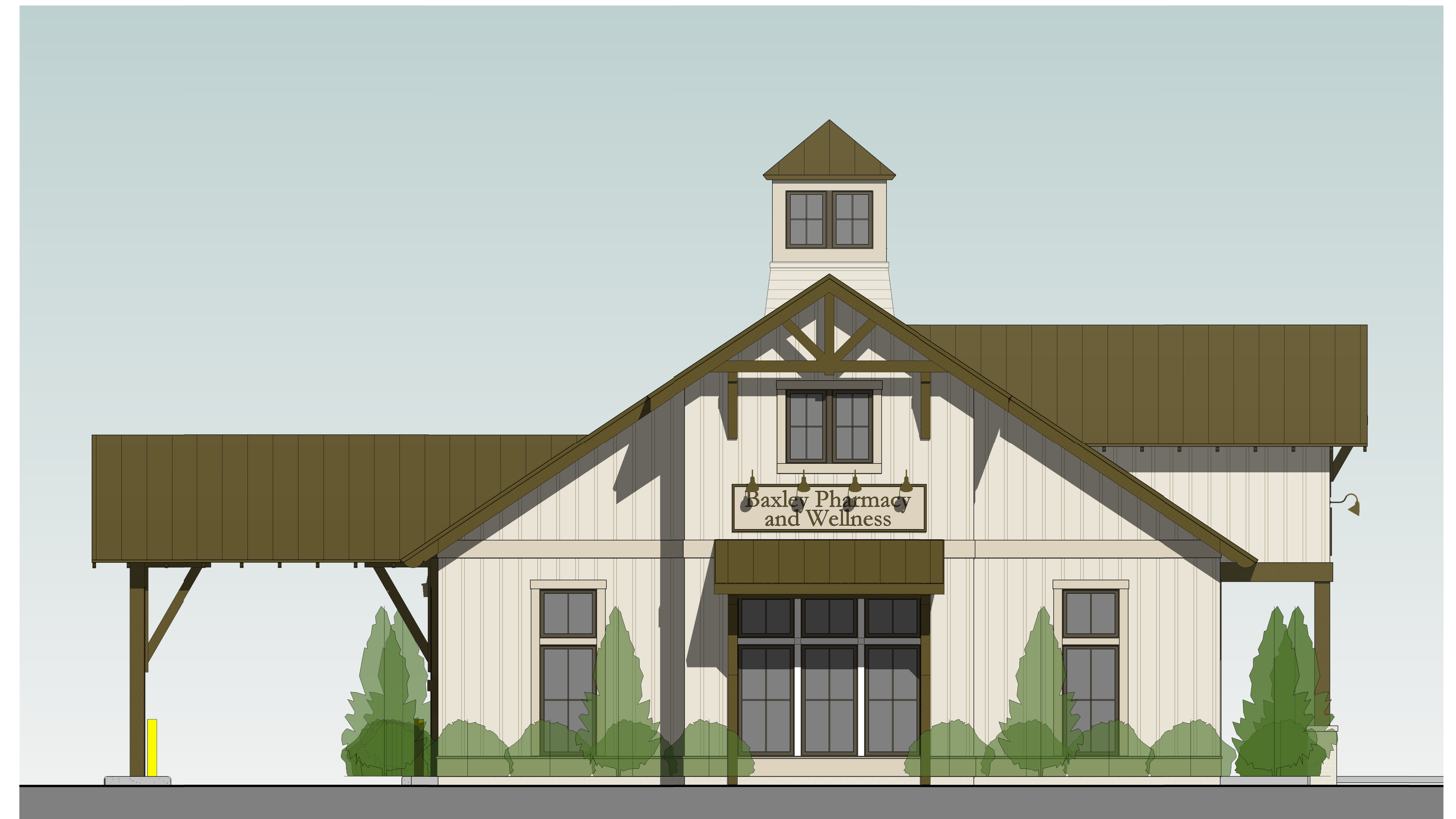
2 Proposed- Building Elevation- Left