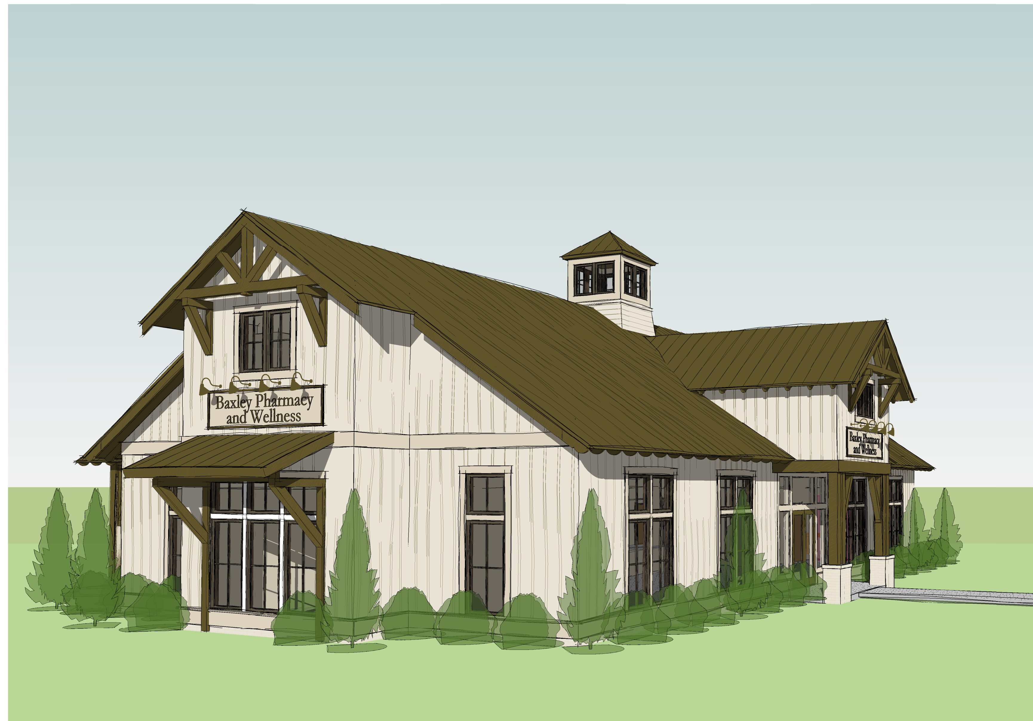
3 Perspective View I