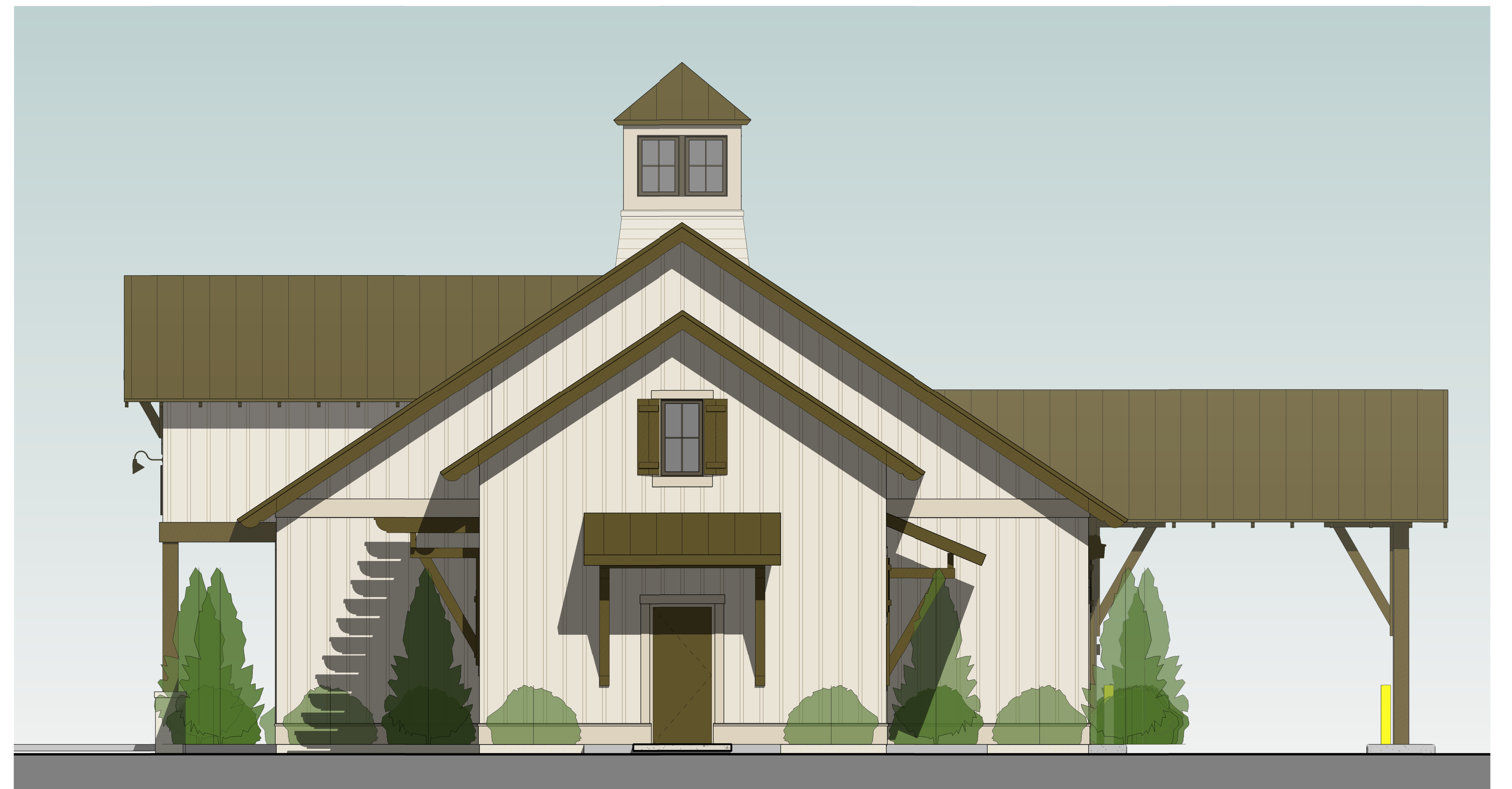
2 Proposed- Building Elevation-Right