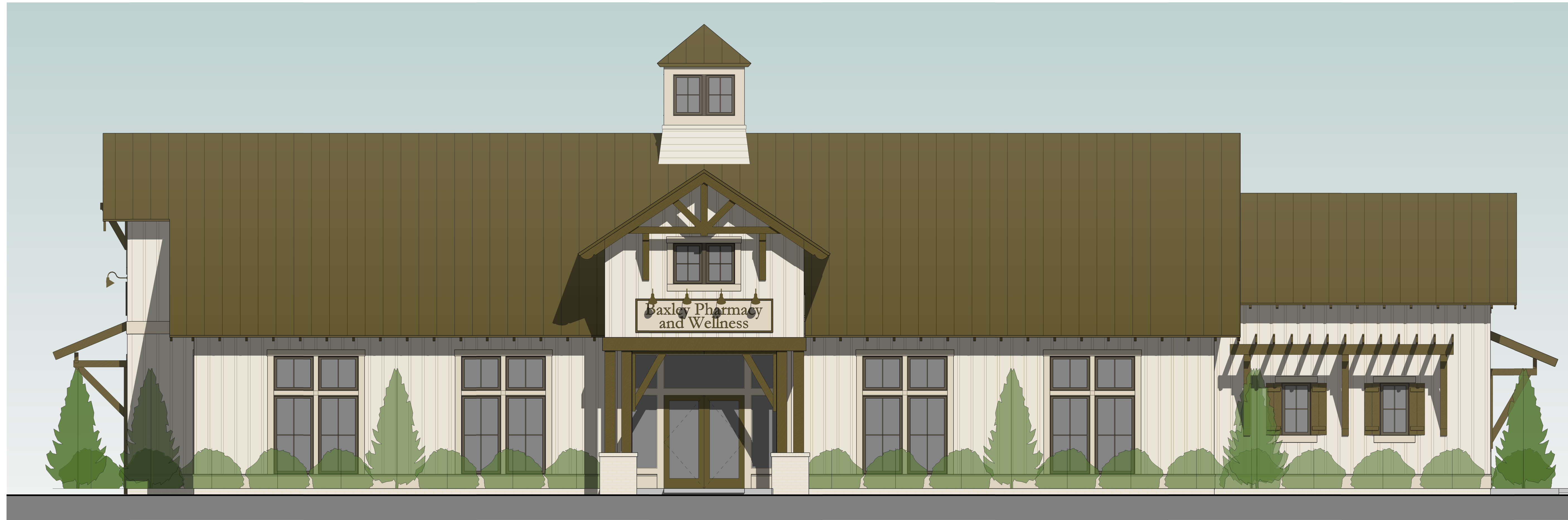
1 Proposed Building Elevation- Front