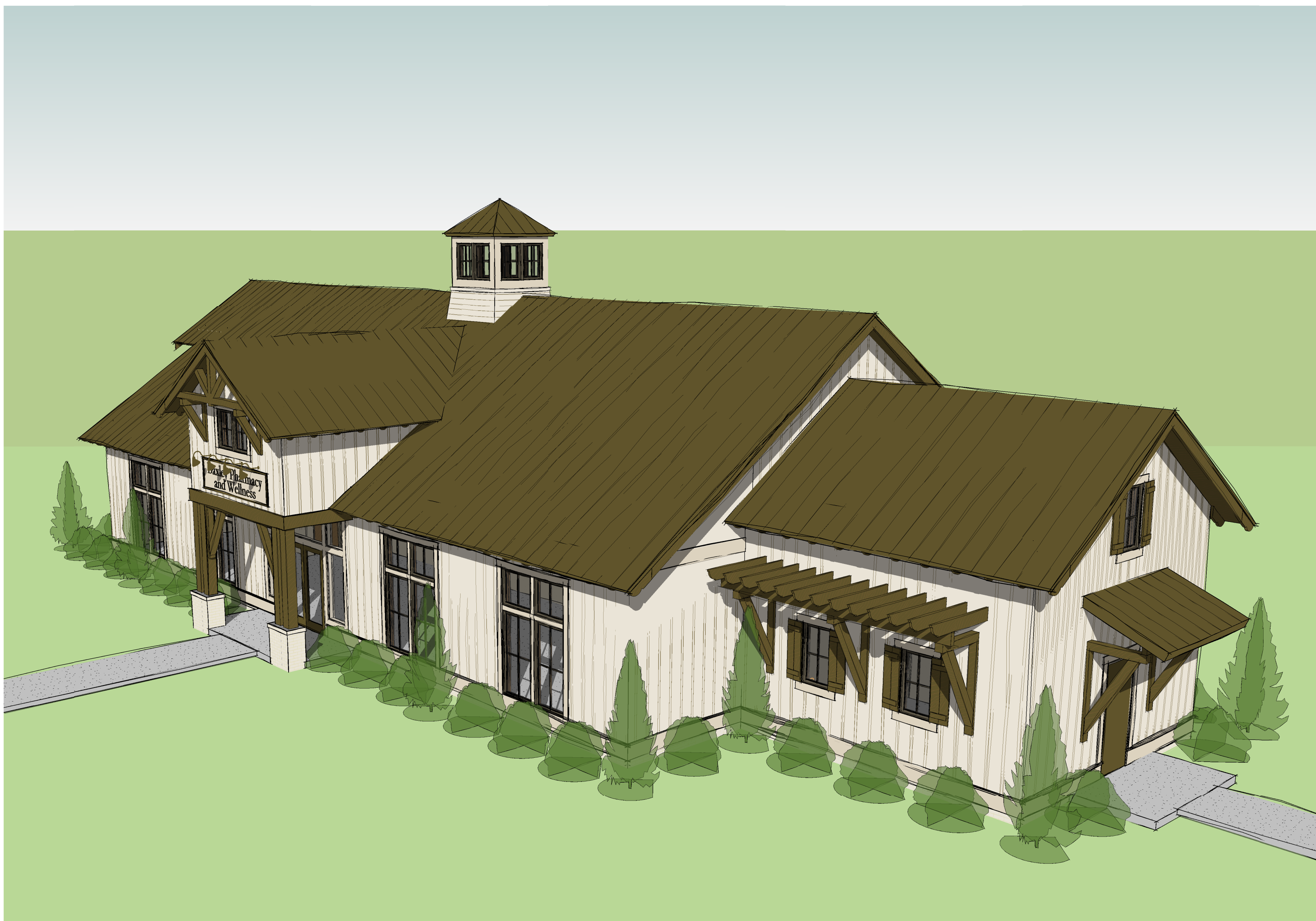
3 Perspective View 2